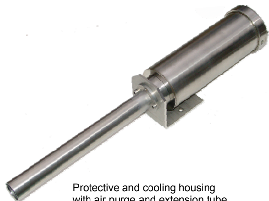
Protective and cooling housing with air purge and extension tube