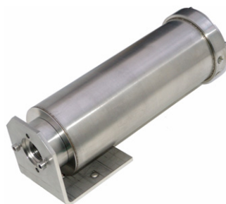
Protective and cooling housing WK15