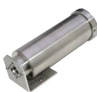
Protective and cooling housing WK15